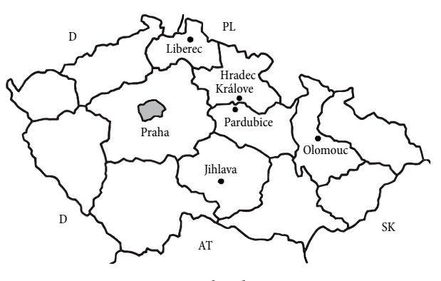
Fig. 1. Analysed regions

The data (numbers and proportions) are related to the time period of the whole day (0-24 h) and arranged