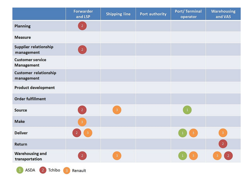
Fig. 2. Port actor-SCM subsystems matrix (compiled by the authors)