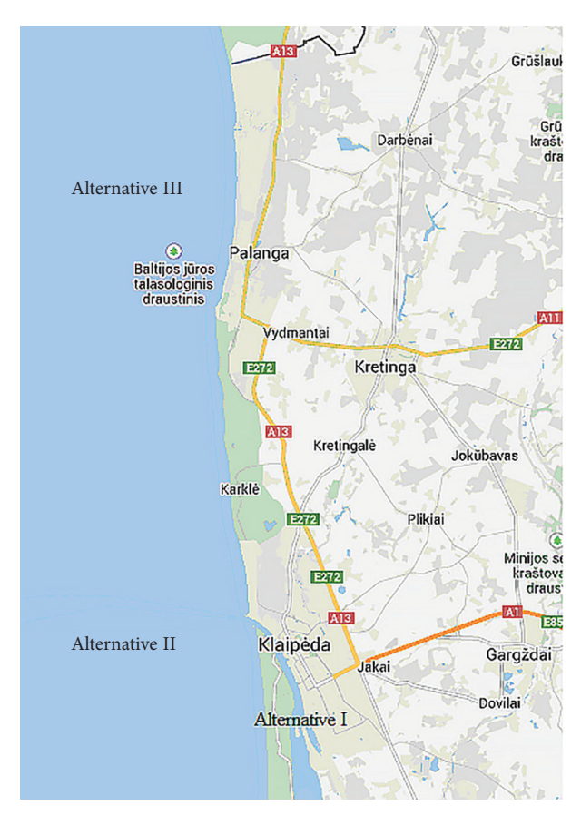
Fig. 2. Potential locations for the LNG terminal

A1. Landscape – prior to implementation of the LNG terminal project and its related infrastructure, it is necessary to conduct a field research, analysing the potential impact on the landscape and the necessity to change provisions of applicable legal acts: Comprehensive Plan of the Territory of the Republic of Lithuania (Lietuvos Respublikos teritorijos... 2002) and Special Plan for Lithuanian Coastal Strip Management (Pajūrio žemyninės dallies... 2011).