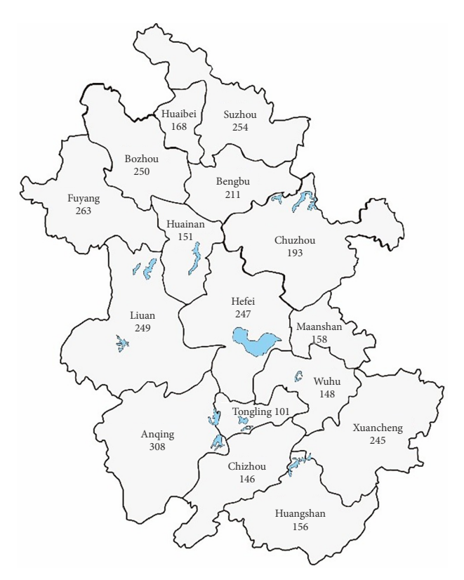
Figure 1. Sample trucks of each city in Anhui Province of China

To identify key factors to road freight overloading, dependent and independent variables need to be defined first. Dependent variables relate to whether a truck has previously had an overloaded trip. Thus, a binary dependent variable was used and defined as 1 = overload, 0 = not\ overload . Independent variables consisted of Vehicle Characteristics, OMs, and TI. VC included VT, VL, RL, Number of Axles (NA), Engine Power (EP) and Engine Displacement (ED). TI included Type of Goods (TG), Type of Transportation (ToT), Travel Mileage (TM), Fuel Consumption (FC), Freight Mileage (FM), FW and AHD. The definitions and descriptions of the 14 independent variables are shown in Table 2.