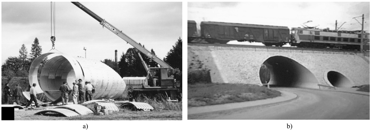
Fig 1. CSPS structures: (a) assembly process in place; (b) one of the example of a finished structure