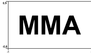
Figure 3. The computation domain.

Difference equation (4.1) approximates equation (2.1) with the first order at the near-boundary points and with the second order at the interior nodes [1]. Difference equation (4.2) does not approximate differential equation at the near-boundary nodes. Both difference schemes (4.1), (4.2) have the second order of convergence [1]. The computation domain is shown in fig. 3.