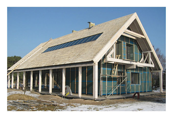
Fig. 1. Single family house "Lielkalni" in Ģipka, Latvia 2009 (late construction stage), E. Krauklis

Since 2009, in Latvia, an association Passive House Latvia has been engaged in organization of the energy-efficient building design training workshops and mainstreamification of the idea. Passive House Latvia recommends the minimum requirements to observe in order to achieve the passive house standard under Latvian climatic conditions (Table 2). The first house designed pursuant to the passive house principles is the one-family residential building "Lielkalni" in Gipka village, Roja rural municipality (Fig. 1).