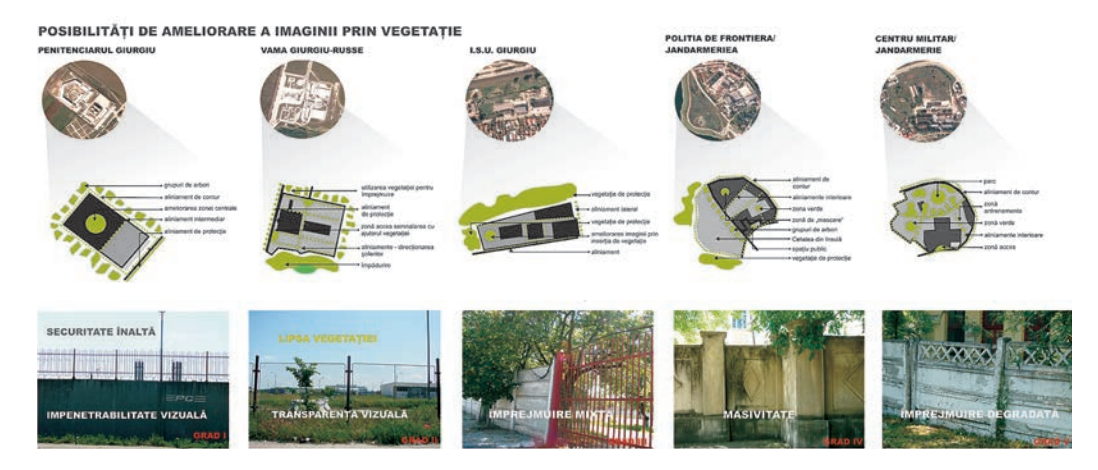
Fig. 5. Pre- diploma – Giurgiu: Landscape Revitalization of the Old Defense Structures and Special Purpose Areas. Specific landscape elements

The detail developed in the actual diploma represents the interference between two military systems: one with historical and cultural importance and the other one of the existing utility. Joining an old defense structure, Giurgiu Fortress, and a special purpose space represented by the Border Police and Gendarmerie, supports the idea that such areas can be simultaneously revitalized, but in different ways, specific to the existing legal regulation (Fig. 7). Increasing the value of the site requires cooperation between authorities and applying specific regulations in compliance with current and future needs.