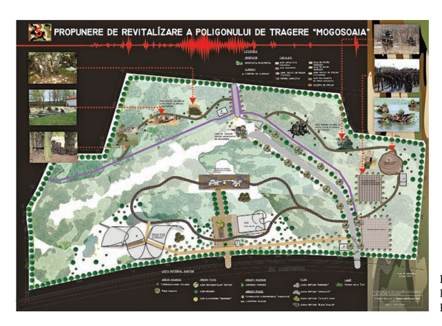
Fig. 3. Licensing Work – Project of revitalization the shooting polygon Mogosoaia – Plan of rearrangement

The proposed intervention is feasible and necessary given that the shooting polygon Mogosoaia must be modernized and transformed into a representative space.