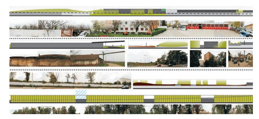
Fig. 6. Pre- diploma – Giurgiu: Landscape Revitalization of the Old Defense Structures and Special Purpose Areas. Specific landscape elements and image study