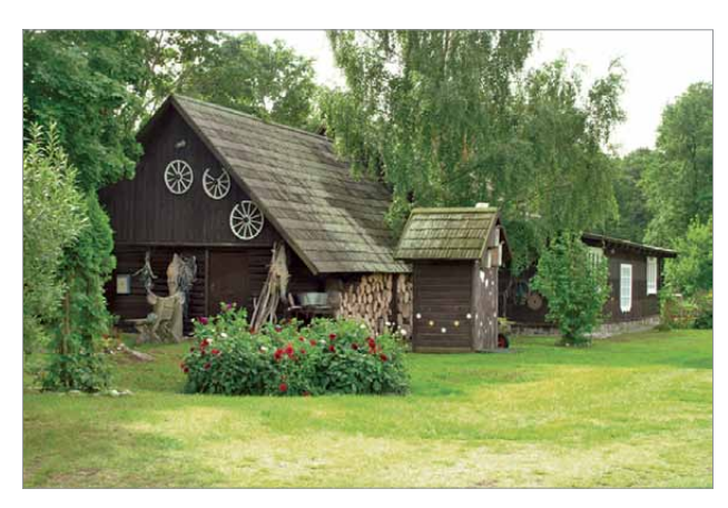
Fig. 5. A contemporary homestead on the Livonian coast (Photo: Ilze Draudina, 2012)