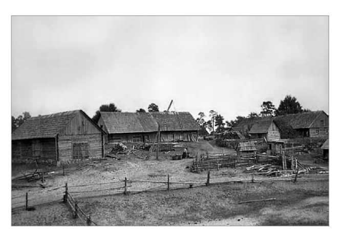
Fig. 4. A typical fishermen's homestead in 1912 (Baku homestead. Melnsils. Photo: Vilho Setele)