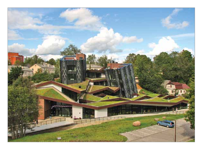
Fig. 4. New green building 'Zeimuls' with landscaped courtyard in Rezekne.

Results of the research of the green zone management revealed that most of the green areas are regularly maintained. Lawns were mown, planting beds of bushes mulched, shrubs shorn, new trees planted and flowerbeds designed in almost all of green spaces that represented the first three groups of areas divided by the quality of manmade elements. The areas without improvement were left