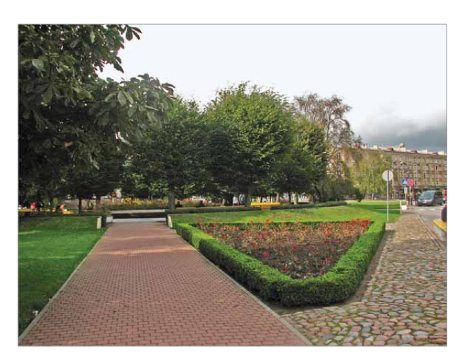
Fig. 2. Plaza of roses with geometrical design in the centre of Liepaja.

Cities selected for the study were Latvian cities with high number of population located in four different planning regions of Latvia. Liepaja is located next to the Baltic See in Kurzeme; Jelgava is situated in the centre of the Zemgale plain with a variety of high-value ecological biotopes; and Rezekne is a city with the typical hilly relief and blue-green area of Latgale. Finally, Valmiera was selected in the region Vidzeme and is located in the picturesque riverside of the River Gauja.