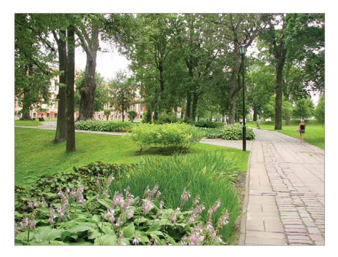
Fig. 1. Historical Landscape Park of Jelgava Palace.