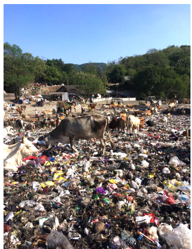
Figure 3. Cows herding and scavengers in Piyungan landfill