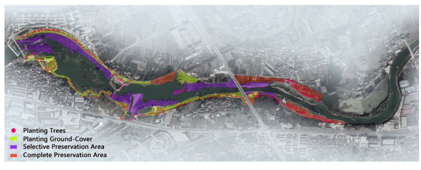
Figure 2. Vegetation preservation and planting planning