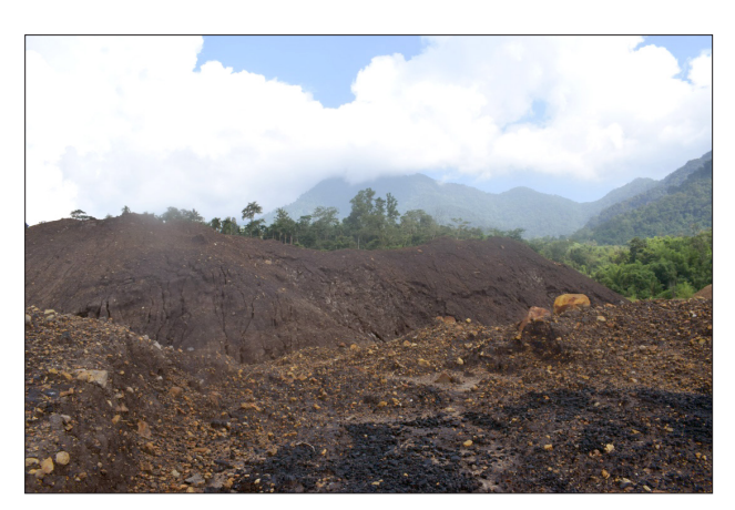
Figure 1. The overburden dumps at the coal mining affected forest floor