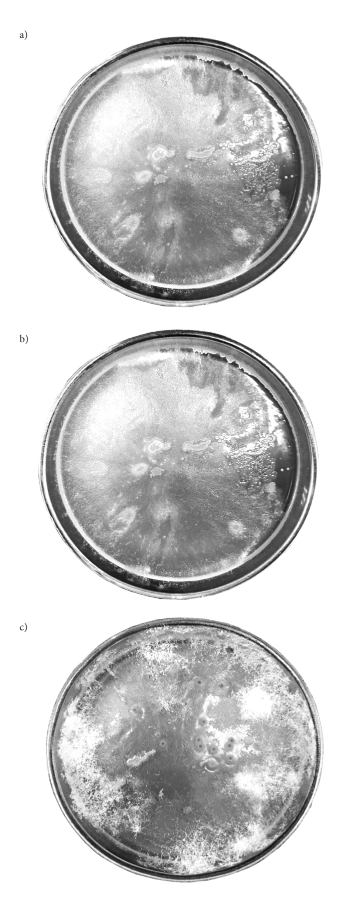
Figure 2. Microbiological analysis of the polluted arctic soil samples: a – 1, b – 2, c – 3 respectively