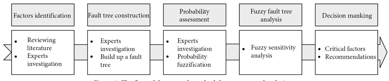
Figure 1. The flow of the research methodology: stages and techniques