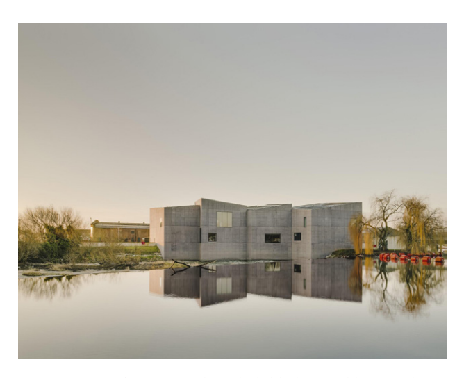
Figure 1. The Hepworth Wakefield, designed by David Chipperfield Architects. Completed 2011.

Documenting the Hepworth Wakefield involved both a conventional architectural site visit, and the reflective process of psychoanalytic research. The initial site visit documented its placement within the wider city organism that is Wakefield, involving the arrival to the build-