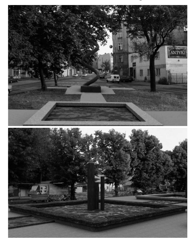
Fig 19, 20. Kościelna street in Poznań (Authors: K. Krupińska, B. Ceglarska under supervision of Dr A. Januchta-Szostak)

Exemplary concepts of locating sculptural and water forms in urban interiors are shown in Figs 19–22.