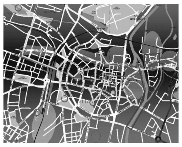
Fig 16. Poznan – wounded spaces (yellow areas) and chosen public places for locating monuments (red circles) in the city center (synthesis)