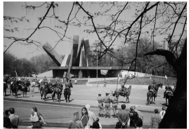
Fig 4. Poznan Army Monument by H. Rodzińska Location: multi-sided, available, penetrative, freestanding object; Form: multi-object composition, compact, dynamic, abstract, symbolic; Function: cultural building, commemorative, integrating, compositional; Scale: XL

Large sculpture compositions enabling gatherings a