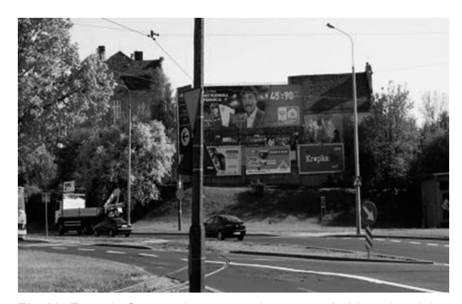
Fig 18. Zawady Street – important places ocupied by advertising art. Blocked view of Śródka with its 17th century monastery and St Kazimierz Church

The final effect of stage I of the analysis is the Catalogue of Public Places in Poznan, containing information about all individual public places with the description of their location, neighborhood, spatial layout and function, short SWOT analysis, and preliminary estimation of capabilities for locating monuments and water elements.