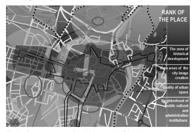
Fig 15. Poznan – areas of the highest rank of the place in the city center (synthesis)