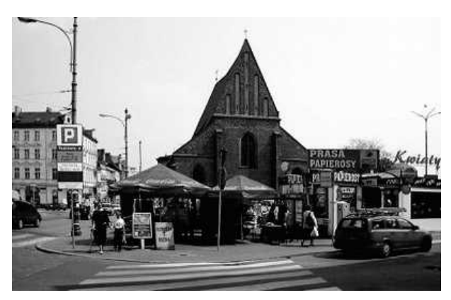
Fig 17. St Marcin's Church. The square in front of the church on the focal point of axis of Marcinkowski Avenue and St Marcin Street occupied by parking places and temporary, substandard elements. The walls of urban interior remain undefined