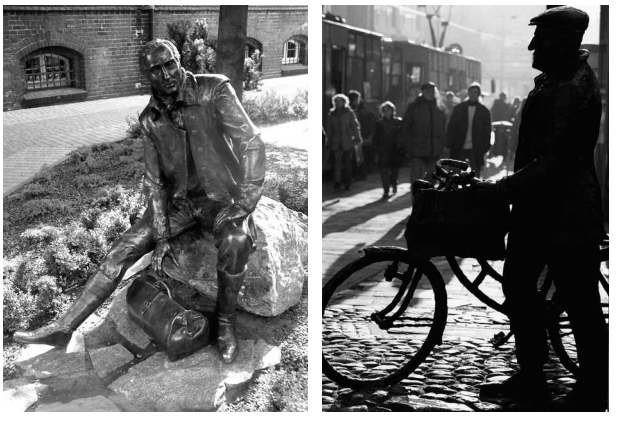
Fig 5. Monument of K. Marcinkowski in front of "Marcinek" [3]

Fig 6. Monument of "Old Marych" on Polwiejska Street [4]