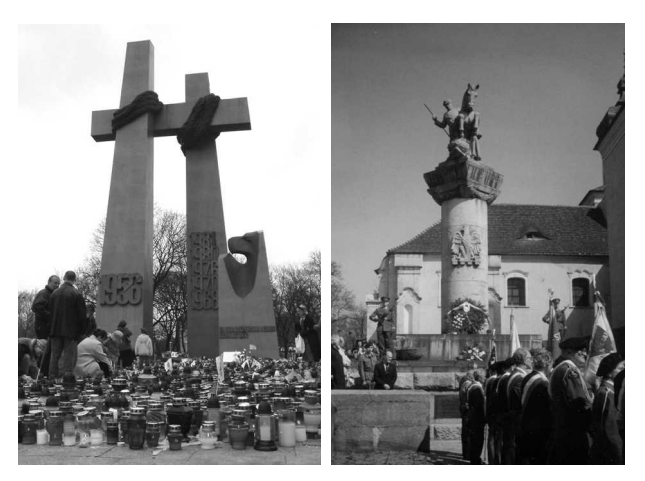
Fig 1. Monument of Victims of a demonstration on 28 June 1956 [3] Fig 2. Monument of 15th Poznan Uhlans Regiment

and Warsaw or Mannekin Pis in Brussels. This famous statue of a little boy is a perfect representative of the irreverent Belgian humor and the unique Brussels icon.