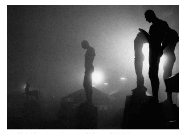
Fig 13. I. Mitoraj's sculpture exhibition on Old Market Square in Poznan, 2003 [4]

Contrary to permanent monuments, temporary sculpture exhibitions and installations in an urban area, as short-time but concentrated events of great cultural expession, can have even a bigger influence on inhabitants' minds and create a sense of cultural identity and unique spirit of the place<sup>2</sup> (e g I. Mitoraj's sculpture exibition at Old Market Square, J. Kopeć's instalation at Freedom Square, exhibitions in front of "Castle" Cultural Center, in Citadel or at Malta Lake).