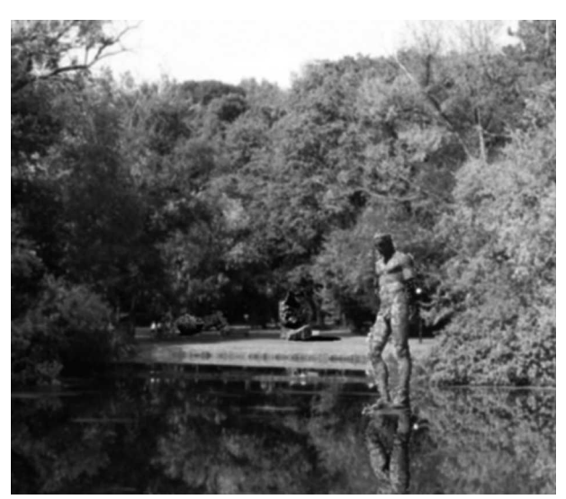
Fig 22. Solacz Park in Poznań (Author: L. Chlasta under supervision of dr A. Januchta-Szostak)

The examples illustrate different possibilities of using water as a foreground for sculpture exhibition.