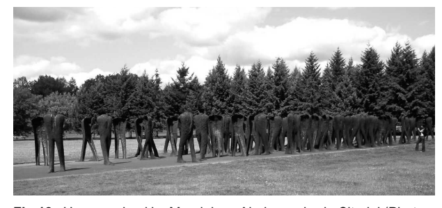
Fig 12. Unrecognized by Magdalena Abakanowicz in Citadel [3]

An excellent example of creating uniqueness of a place in park landscape is sculpture exhibition of Magdalena Abakanowicz in Citadel. It is deeply rooted in history which emphasizes identity of the place of memory having a modern form at the same time.