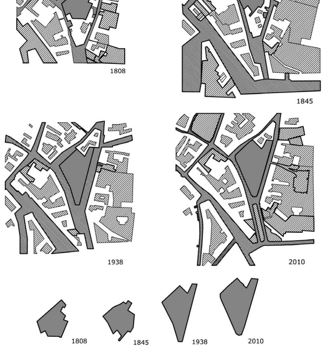
Fig. 15. Changing spatial structure of Arklių Square in Vilnius during different periods of historic development