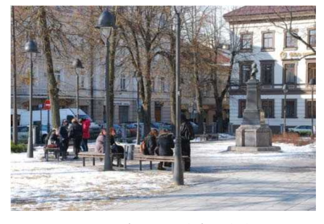
Fig. 10. Spectators prefer to sit aside from the busy transit flows on Moniuškos Square. G. Stauskis fig. Mar. 2011

The overall space was changed and increased during these periods mainly by installing a new street during the second half of the XIXth c. and demolishing some buildings after the World War II.A quiet monument to nobleman Juozapas Montvila (1805–1911) was installed in 1935 and the square gained a greater memorial importance (Fig. 13). By placing the transit flow along the bordering facade, the square gained certain function of recreational communication. There is a clear performance area, even a small back-stage and a predesigned sitting space for spectators. Some visitors are always present on the square: kids from the across-thestreet kindergarten, students from local schools and universities, and certainly monks and priests together