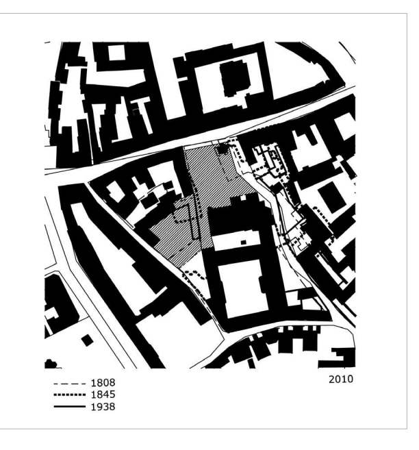
Fig. 12. Planning development of Pranciškonų Square in Vilnius XIX–XXI c.c.

Beside the next urban gateway leading from the heart of the Old Town to Trakai – the ancient capital of Lithuania – on Trakai street, lies the square of the Franciscan Convent (Fig. 11). Again, having appeared as an internal courtyard of the Franciscan Convent and adjacent to the Franciscan Church, the square served many functions, including the cemetery for noble citizens up until the very end of the XVIIIth c., which was brutally excavated from the square by Soviet authorities in 1968. According to the analysis of historical developments (Fig. 12), the boundaries of the square were changed and a transit flow of pedestrians appeared.