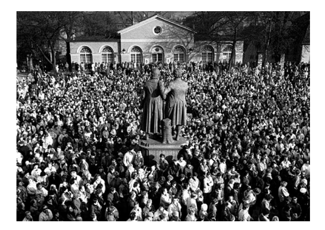
Fig. 2. Theaterplatz in Weimar was always a place of the most serious assemblies for local citizens. Citizens' meeting on the occasion of reunification of Germany. Nov. 19, 1989

which originated at the time when both writers resided in Weimar and the city became the place for intellectual pilgrims seeking for some kind of an enlightened movement, which, apparently, was expressed in the form of the French Revolution in France, however was violently repressed by the fragmented and restorative German states. Schiller fled from political persecution to Weimar from the South-West of Germany and Goethe – apart from his literary production – got involved in the local court to introduce modern reforms.