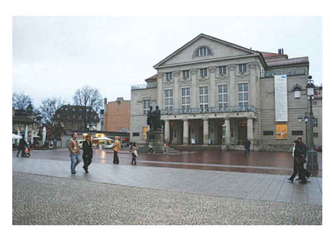
Fig. 1. Theaterplatz – the most vivid public space of Weimar and main destination for tourists. Anika Müller fig. Mar. 2011

Today, the statue on the Theaterplatz is the most photographed object and the main attraction for tourist visiting Weimar. Although probably unappreciated by many visitors of the contemporary Weimar as something that represents the "better Germany", this is exactly what the statute embodied for a long time (Fig. 2). This perception is based on a myth (Eckardt 2006b),