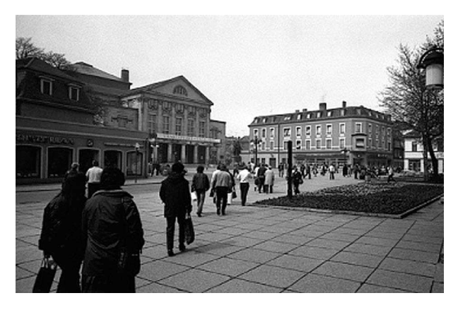
Fig. 3. The Theaterplatz is located on an urban crossroad, it was always actively used by pedestrians. 1980