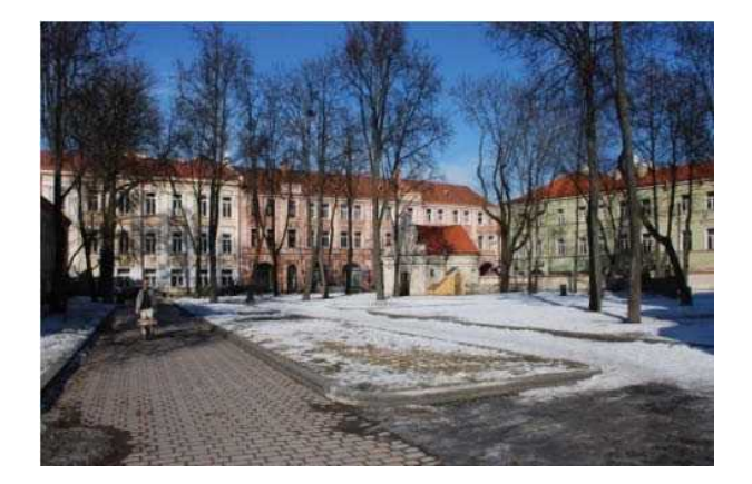
Fig. 11. An extra-wide transit route leads to the side of the Pranciškonų (Franciscan) Square leaving the main space free for the observers and the performers. G. Stauskis fig. Mar. 2011

The overall space was changed and increased during these periods mainly by installing a new street during the second half of the XIXth c. and demolishing some buildings after the World War II.A quiet monument to nobleman Juozapas Montvila (1805–1911) was installed in 1935 and the square gained a greater memorial importance (Fig. 13). By placing the transit flow along the bordering facade, the square gained certain function of recreational communication. There is a clear performance area, even a small back-stage and a predesigned sitting space for spectators. Some visitors are always present on the square: kids from the across-thestreet kindergarten, students from local schools and universities, and certainly monks and priests together