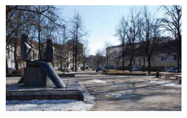
Fig. 16. Through-pass is cutting across the nice scenery of a historic space of Lazdynų Pelėdos Square where spectators area is split by the transit route and there is no back-stage. G. Stauskis fig. Mar. 2011