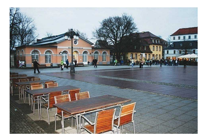
Fig. 5. The old Bauhaus-Museum at the Theaterplatz. Anika Müller fig. Mar. 2011