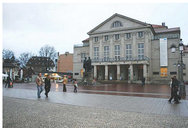
Fig. 6. Theaterplatz – the most vivid public space of Weimar and main destination for tourists. Anika Müller fig. Mar. 2011