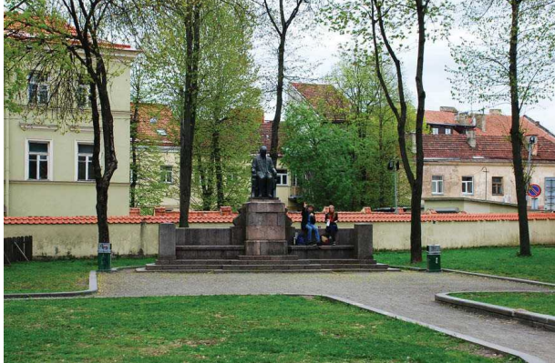
Fig. 13. Spectators make use of ready-made observation seats by J. Montvila monument on the Pranciškonų (Franciscan) Square. Even a certain back-stage is fit for user performances behind the monument. G. Stauskis fig. Mar. 2011