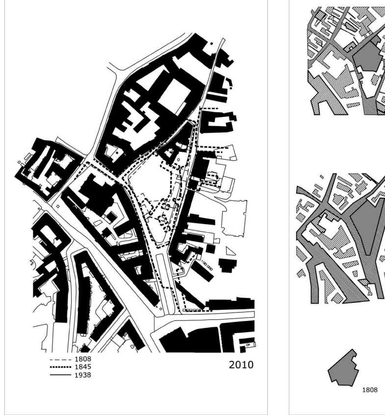
Fig. 14. Periods of planning evolution at Arklių Square in Vilnius XIX–XXI c.c.

The case of the Theaterplatz in Weimar reveals a similarly peculiar picture. This space is highly attractive