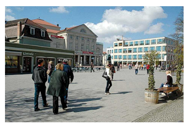
Fig. 4. Recently, more space for public show on the Theaterplatz and some place for the spectators appeared. 2011