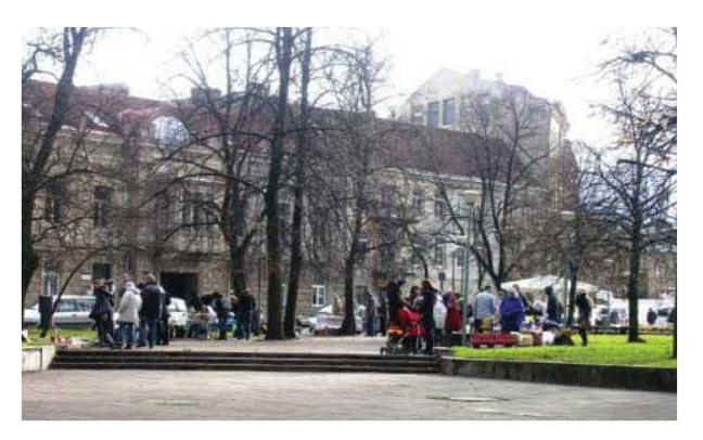
Fig. 17. A weekend flea-market on the Lazdynų Pelėdos Square is are al show where spectators are more active than actors. I. Urbonaitė fig. Oct. 2010

for different and diverse activities. It is part of a pedestrian area, which to some extent solves the question of traffic flows, but it still remains to be the place, which requires the entire urban geography to be adjusted to the flow of more than three million visitors every year in a city of sixty thousand inhabitants. Accessibility is thus the main subject for urban planning (see Figs 1–6).