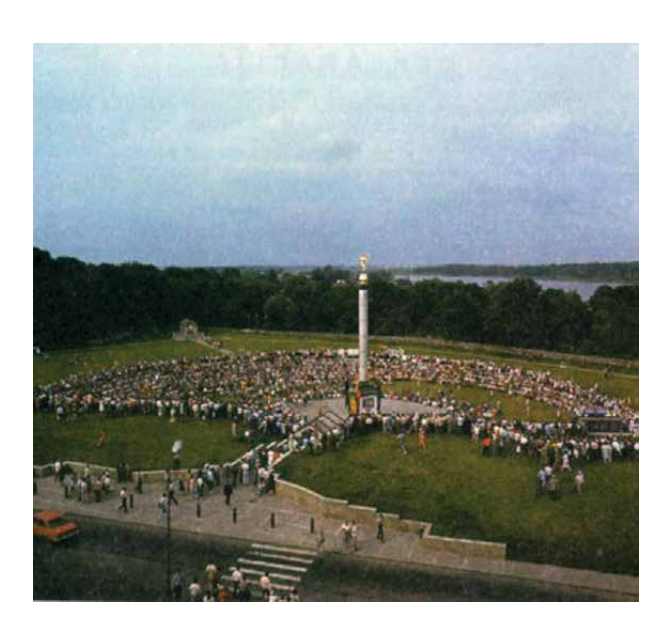
Fig. 1. The first meeting of Sqjūdis , 2 July 1988, the Sundial Square in Šiauliai