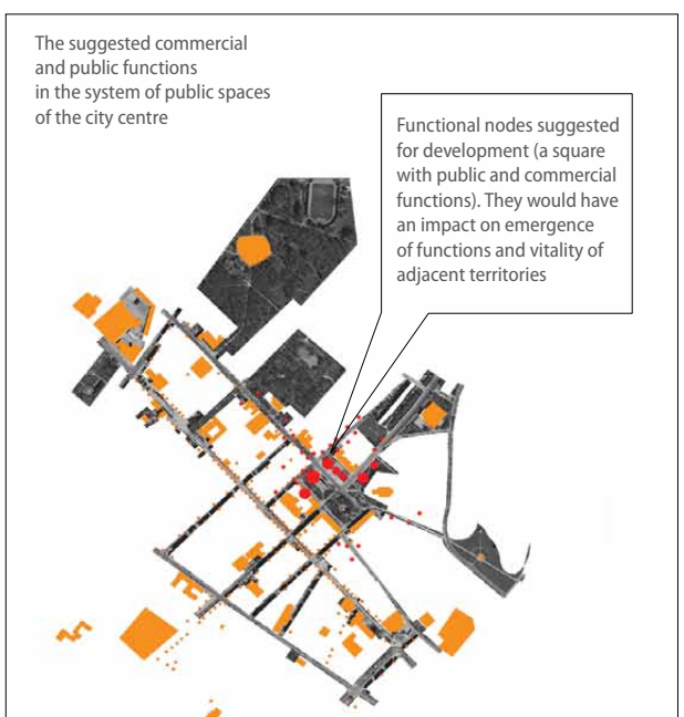
Fig. 2. The system of public spaces in the centre of Šiauliai. Analysis and proposals by the AEXN architects

thetical-compositional whole in prevalence of strong political and economic ideology. The 19th century renovations of European capitals were possible only because of strong monarchies of the time and the accompanying imperial thinking. But even more important is the fact that a dominant trend in all examples of such renovations is public spaces and their systems. An equally great focus was placed on the infrastructures and renovations of public space systems including main streets, parks, boulevards and city squares. The system of public spaces and its constituent parts (elements) were made relevant and solved according to the understanding and concept of urban public space of an appropriate period as well as requirements raised to such system. Nowadays, such requirements are changed and - although a unanimous concept of urban public space is more or less entrenched in the legal framework with its subsidiary phenomena providing exclusiveness and identity to the system being defined in less dogmatic way - the formation practice of public spaces is often considered an activity of artistic creation. It is dominated by more subjective rather than objective criteria encompassing only a part of the requirements and leaving more freedom even to interpretations of the design task.