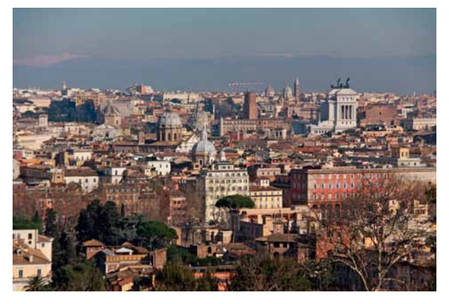
Fig.11. Silhouette of Rome without modern dominants

city builders achievements. The new high-rise business and residential buildings are located in the new district beyond 2 inflows of the Danube far from the old Vienna with St. Stephen's Cathedral. The same situation is in Rome (Fig. 11), Amsterdam and Brussels.