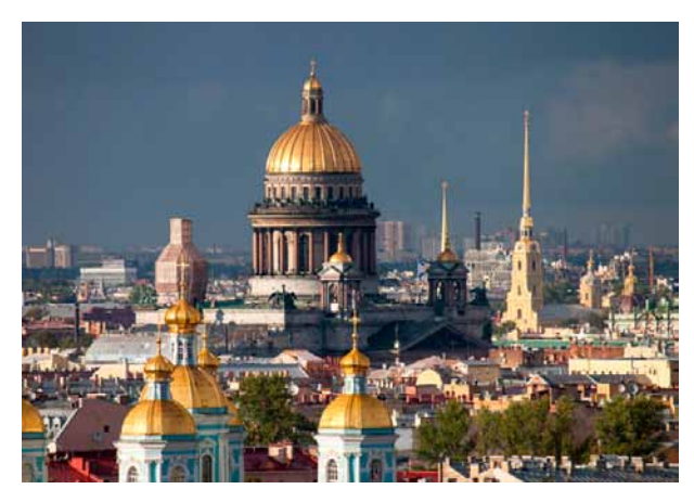
Fig. 1. St. Isaac's Cathedral a significant high-rise accent of St. Petersburg in 1858 (Blinov 2014)

5–6-storey buildings with mansards appeared in the center and the suburbs (Lisovskij 2004). For successful construction on swamp ground, people used 6–8 meter wooden piles, but this system was not always effective: during the period when it was in use, St. Isaac's Cathedral bent and sagged for a few tens of centimeters, and the foundations of the Rostral Columns also had to be corrected.