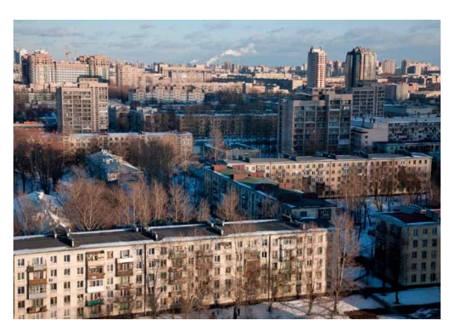
Fig. 2. USSR economical types of houses (Moskovsky district 2015)

High-rise buildings were a completely a new type of housing – both for specialists and ordinary people. In addition to the analysis of Russian results, a lot of attention was paid on the study of international experi-