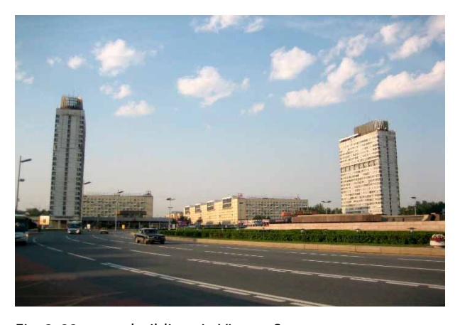
Fig. 3. 22-storey buildings in Victory Square

ence. Not only did various publications appear, but also, different symposia involving the participation of foreign scientists were organized (Maksai 1979). Specialists bought technologies in small volumes, and numerous research organizations were involved in developing the sphere. Much attention was paid on the pragmatic aspects, such as fire-prevention systems (Raeva et al. 1976) and the particularities of sanitary conditions inside buildings (Syreyschikov 1972). Strict attention was focused on the building foundation of Leningrad (Olhova et al. 1967). It turned out that the ancient and acceptably strong sedimentary and moraine soil was located at a depth of 20-30 m (it was taken into consideration when making tunnels for the Petersburg Underground). Near the surface there is weak and heterogeneous, water-saturated silty-clay soil. Such soil causes a large settling of the ground, that usually lasts for tens and even hundreds of years. People had to use piles of up to 20-30 meters (Shukurova 1977). In difficult situations the piles did not help – they were "sucked in". They had to stop the construction of the 18-storey tower on Constitution Square in the 1970s because the foundation of high-rise buildings began to set into the ground. The planned