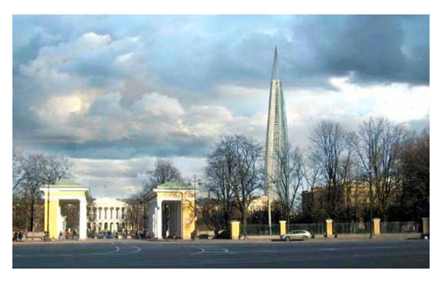
Fig. 5. Okhta Centre (known until March 2017 as Gazprom City) would ruin the city's appearance