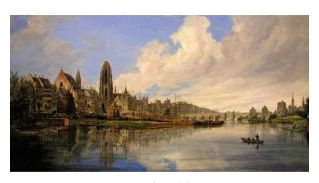
Fig. 8. Historical panorama of Frankfurt (Germany)

However, many historical cities use high-rise construction, bringing it beyond the visual connection to the historical center, saving the historical identity of the city center. Assessing the experience of multi-storey construction and high-rise buildings in the European cities, special attention should be paid to the Viennese