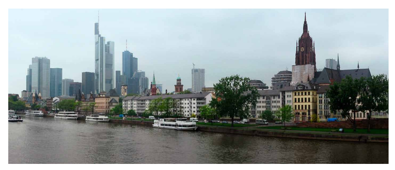
Fig. 9. Reconstruction of the center of Frankfurt (Germany). The new city silhouette formation