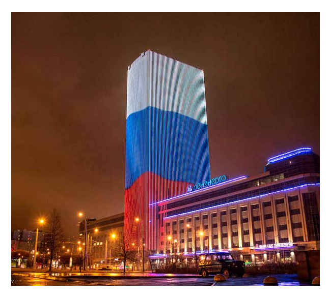
Fig. 6. The "Leader Tower" is located at a distance from the historical center (Business center 2014)

project wasn't realized, but the positive potential of globalization for the protection of historical and cultural heritage appeared.