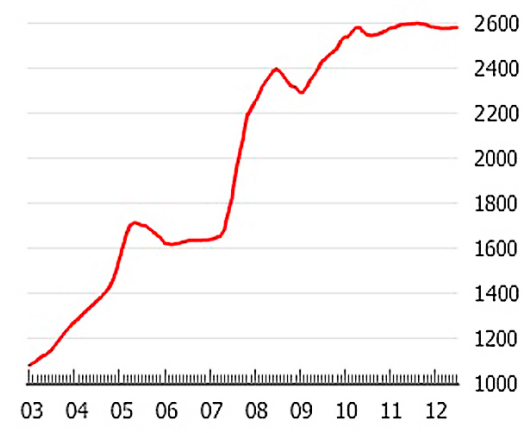
Fig. 3. Second-hand House Price Index, Shanghai (2003 = 1000)

is based on accounting profit (a poor proxy for economic profit), is distorted by inflation. In particular, he demonstrated that under inflation, for a firm holding non-depreciable fixed assets with a project duration of, say, four years, the EVA of the firm is understated. De Villiers (1997) derived the adjusted EVA (AEVA), which provides a better estimate of actual profitability under inflation, as an alternative performance measurement tool for companies.