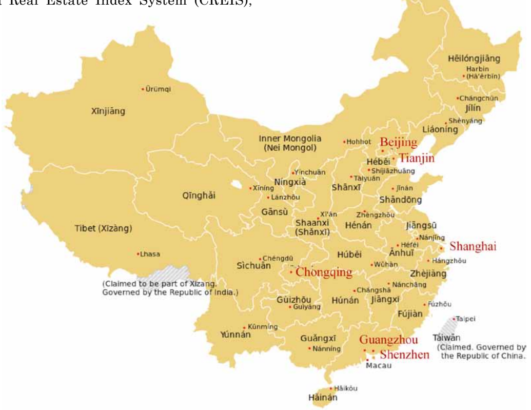
Fig. 1. Provincial map in China

as indicators of house prices in different cities<sup>2</sup>. These six cities have the largest population expansion, employment opportunities and economic growth in China and are a magnet for more efficient investment and businesses. For example, the Beijing and Shanghai market play an important role as a price leader and should be watched for policy control, while Shenzhen is the first special economic zone in China, which makes is significantly distinct from other cities. The sample data cover the time period from December 2000 to July 2013^3 . Figure 1 presents the geographical location of the China regions. Chongqing is the seat of the interior area, while the other cities are located in the Eastern region. All price indexes are expressed in natural logarithms and are deflated with a base point of 1,000 in Beijing in December 2000. Figure 2 includes the time-series plots of the six house price indices included in our model and the box plots summarizing the distribution of a set of data. The box plot is composed using few primary elements: the edges of the box are the first and third quartiles; the median and mean is depicted using a line and a symbol in the