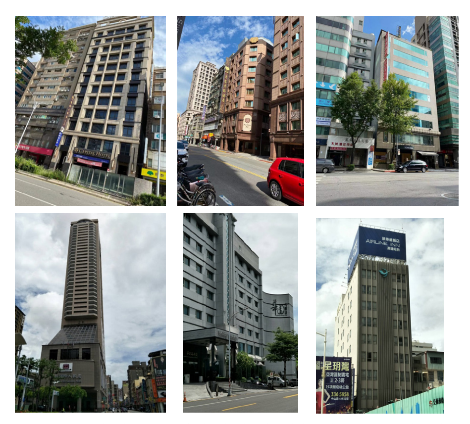
Figure 1. Some tourist hotels in Taiwan disclosed online for sale by real estate agents

and buyers on the accuracy of hotel appraisal prices. Singh and Schmidgall (2005) predicted key events and impacts on hotel investments. Although Liu et al. (2012a) reported the elements influencing efficiency hotel appraisal efficiency, they did not examine the appraisal determinants and their prioritizations for decision-makers in the real world.