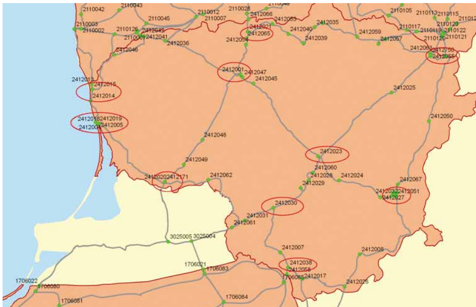
Fig. 3. The Lithuanian NGVN in UELN (red ellipses show the datum points of the NGVN)

In summer of 2007, the NGVN was integrated into the UELN (Fig. 3) (Krikštaponis et al. 2011).