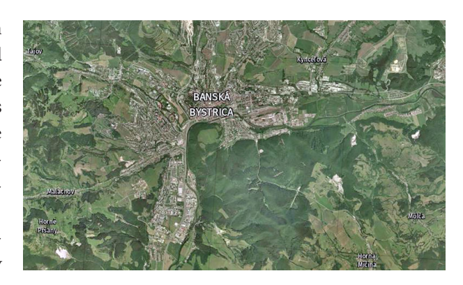
Fig. 4. Example of labels above the orthophotomap

However, there are several limitations of our data styling in the WMA, with regard to styling in general rather than SLD styling. Issue, which is most pronounced for health and demographic data and municipality level of territorial units, is rate reliability. Many