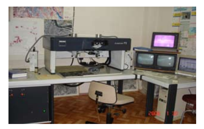
Fig 1. Analytical stereo plotter PLANICOMP P3 with a modification for education

PLANICOMP P3 with images orientation software P-CAP is used. This instrument is of excellent working condition and additionally equipped (at Photogrammetry Institute of Bonn University, Germany) with CCD cameras. It is very important from the point of view of education, because point's identification and feature interpretation can be observed on the monitors as well (Fig 1). Received geodata from stereo measurements are possible to use in GIS environment like ArcView, AutoCad etc.