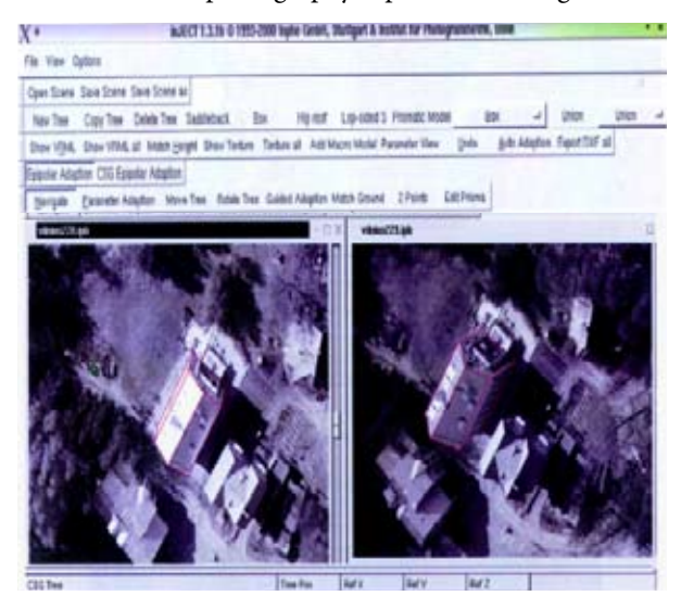
Fig 2. Fragment of building extraction by wire-frame adaptation method

The training in feature extraction (eg 3-D building's model creation) can be performed using digital system InJECT , developed at the Photogrammetry Institute of Bonn University. The user of InJECT is supported by tools with site modelling. Fragment of buildings extraction from aerial photography is presented in Fig 2.