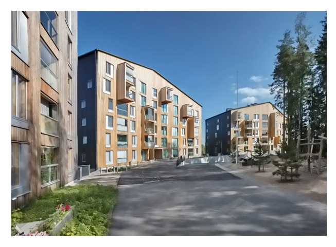
Figure 2. Puukuokka housing block (OOPEAA, 2021)

Puukuokka was a pilot project to develop and test a cross-layered timber module system. The entire structure and the frame of the buildings are made of solid wood and