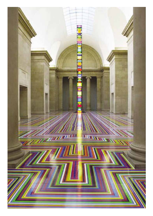
Fig. 3. Jim Lambie. Touch Zobop , Duveen Galleries, Tate Britain, 2003

taken for granted. It is the ground on which we contemplate the action taking place on a thoughtful plane somewhere at eye level. Zobop (Fig. 3) reveals the floor as the basis of an architectural space that presumes a vertical conceptual orientation. By refusing the verticality of the painted canvas, Lambie liberates colour and almost literally tips it at our feet. By colouring the floor, making it the surface of painting, the floor itself is invited out of its background presence, out of neutrality into an uncanny presence. Unexpectedly the work throws a light on how much work the floor does, how it holds me up, guides me through space, facilitates movement through a world.