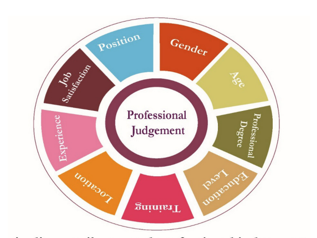
Auditor attributes and professional judgement

However, based on the above literature and hypothesis, a theoretical framework is drawn with all the professional auditor judgment attributes. Figure 2 presents the framework of auditor attributes and professional judgment.